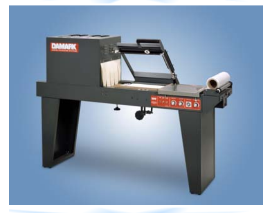
Maxi-Pak Model MP-3: